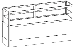
HALF VISION SHOWCASE