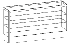
FULL VISION SHOWCASE